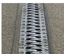
Cantilever finger joint