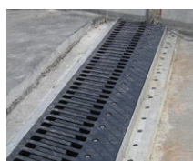
Sliding finger joints